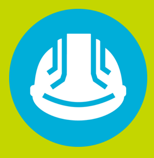
20 Home Repair Completions